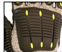
TPR on back of hand