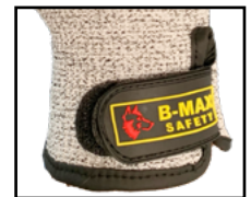
Velcro strap on cuffs