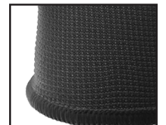
Elastic knitted cuffs