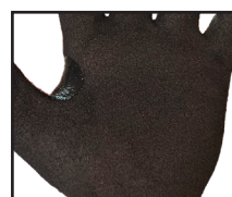
Sandy Nitrile coated palm