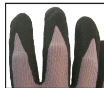
Sandy Nitrile coated finger tips