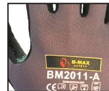
Seamless knit liner