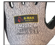
Seamless HPPE knit liner