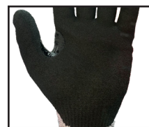
Full Nitrile coated palm