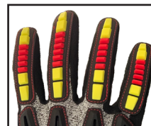
Full TPR on fingers