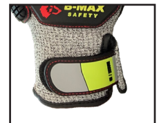
Velcro strap on cuffs