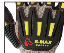
TPR on back of hand